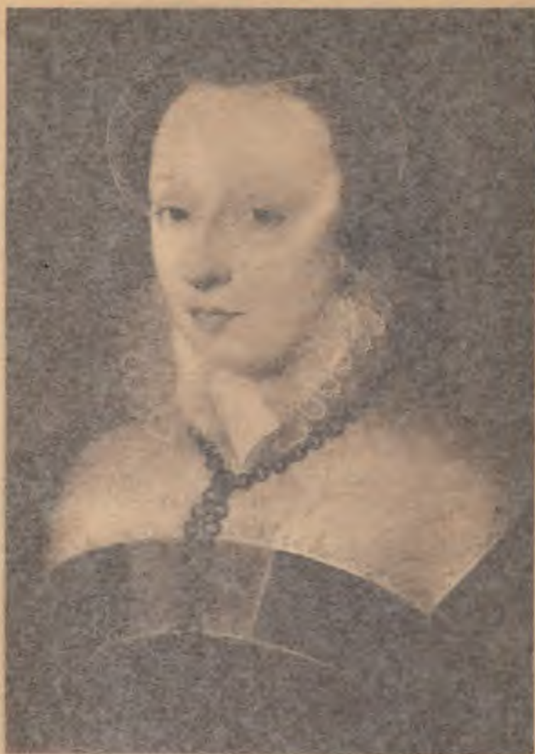
Deux de France